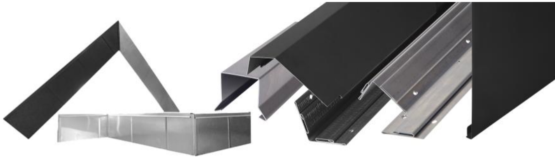
Figure 3: Picture of the declared product.