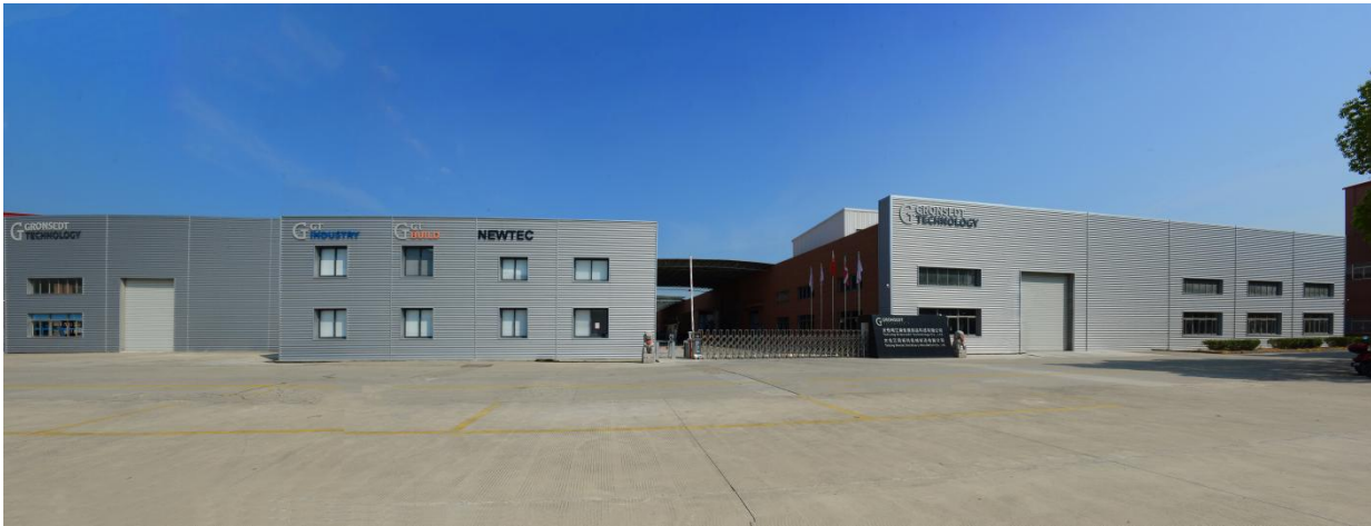
Figure 1: Picture of the company

Gronstedt Technology is a private, family-owned Danish company group established in 2007. We specialize in the design, production, and sale of stainless steel and aluminum products. Our offerings include both mass-produced products for the construction industry through our GTBUILD division, as well as smaller series and customized products for a variety of industries through our GTINDUSTRY division. With a presence in Europe, Asia, and the Middle East—including our own factories, central warehouse, and distribution center in China—we supply products to customers worldwide, either directly or via our distribution center in Denmark for European clients.