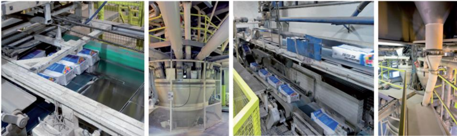
Figure 1: production process detail

The production process starts from raw materials, that are purchased from external and intercompany suppliers and stored in the plant. Bulk raw materials are stored in specific silos and added automatically in the production mixer, according to the formula of the product. Other raw materials, supplied in bags, big bags or tanks, are stored in the warehouse and added automatically or manually in the mixer. The production is a discontinuous process, in which all the components are mechanically mixed in batches. The semi-finished product is then packaged, put on wooden pallets and stored in the finished products warehouse. The quality of final products is controlled before the sale.