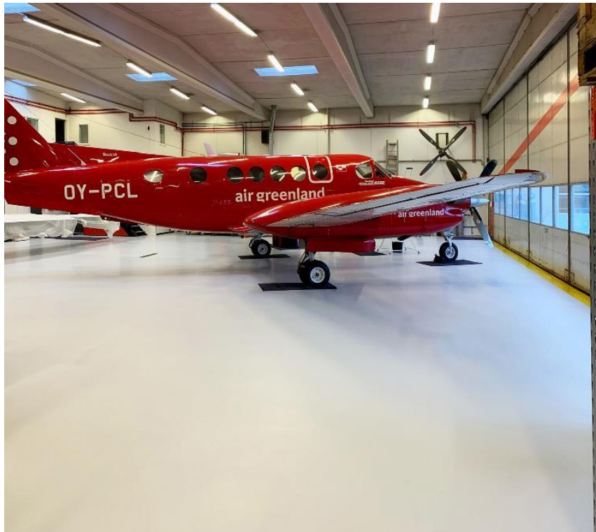
Figure 2: Roskilde Airport, Danmark

For more information see the TDS (Technical Data Sheet) on Mapei AS website ( www.mapei.com/NO ).