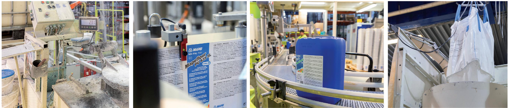
Figure 2: production process detail - © Photo Halvor Gudim

The production process starts from raw materials, that are purchased from external and intercompany suppliers and stored in the plant. Bulk raw materials are stored in specific silos and added automatically in the production mixer, according to the formula of the product. Other raw materials, supplied in bags, big bags or tanks, are stored in the warehouse and added automatically or manually in the mixer. The production is a discontinuous process, in which all the components are mechanically mixed in batches. The semi-finished product is then packaged, put on wooden pallets and stored in the finished products warehouse. The quality of final products is controlled before the sale.