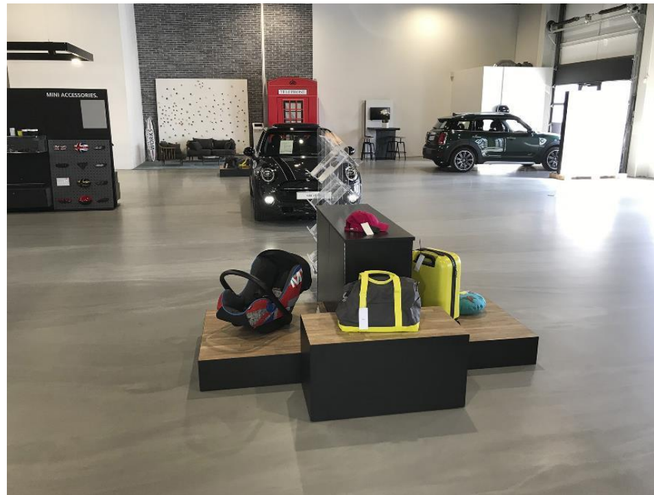
Figure 1: Showroom, Kgs. Lyngby, Danmark

For more information see the TDS (Technical Data Sheet) on Mapei AS website ( www.mapei.com/NO ).