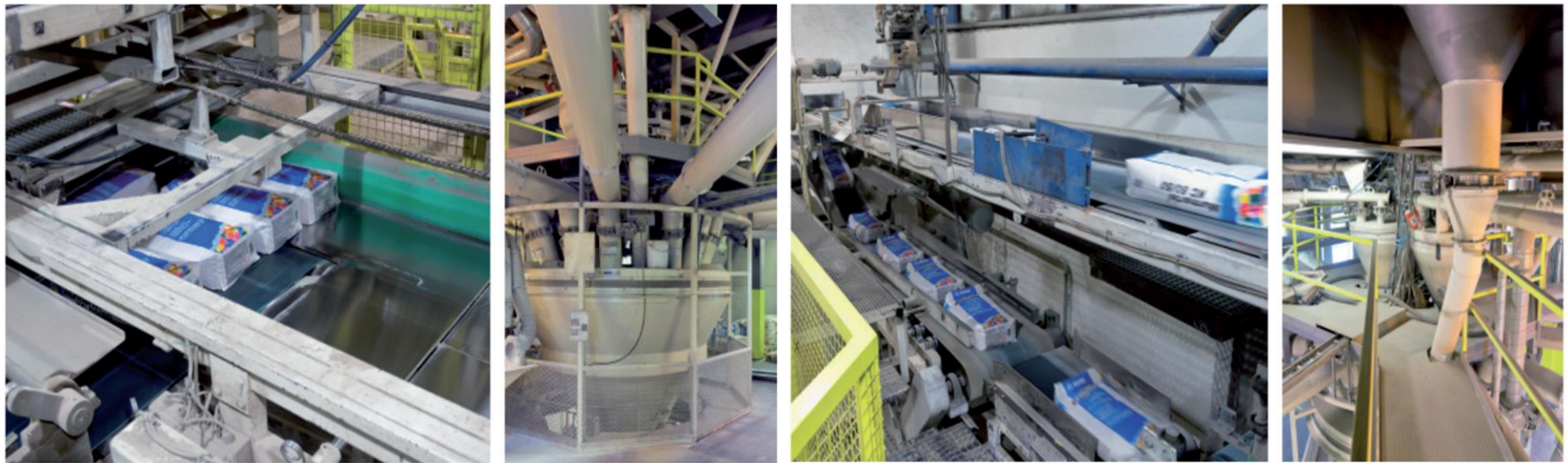
Figure 1: production process detail

The production process starts from raw materials, that are purchased from external and intercompany suppliers and stored in the plant. Bulk raw materials are stored in specific silos and added automatically in the production mixer, according to the formula of the product. Other raw materials, supplied in bags, big bags or tanks, are stored in the warehouse and added automatically or manually in the mixer. The production is a discontinuous process, in which all the components are mechanically mixed in batches. The semi-finished product is then packaged, put on wooden pallets and stored in the finished products warehouse. The quality of final products is controlled before the sale.